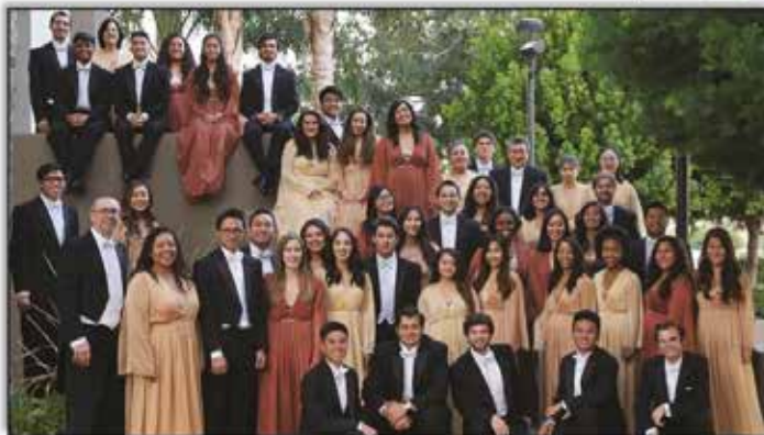
La Sierra University Choir